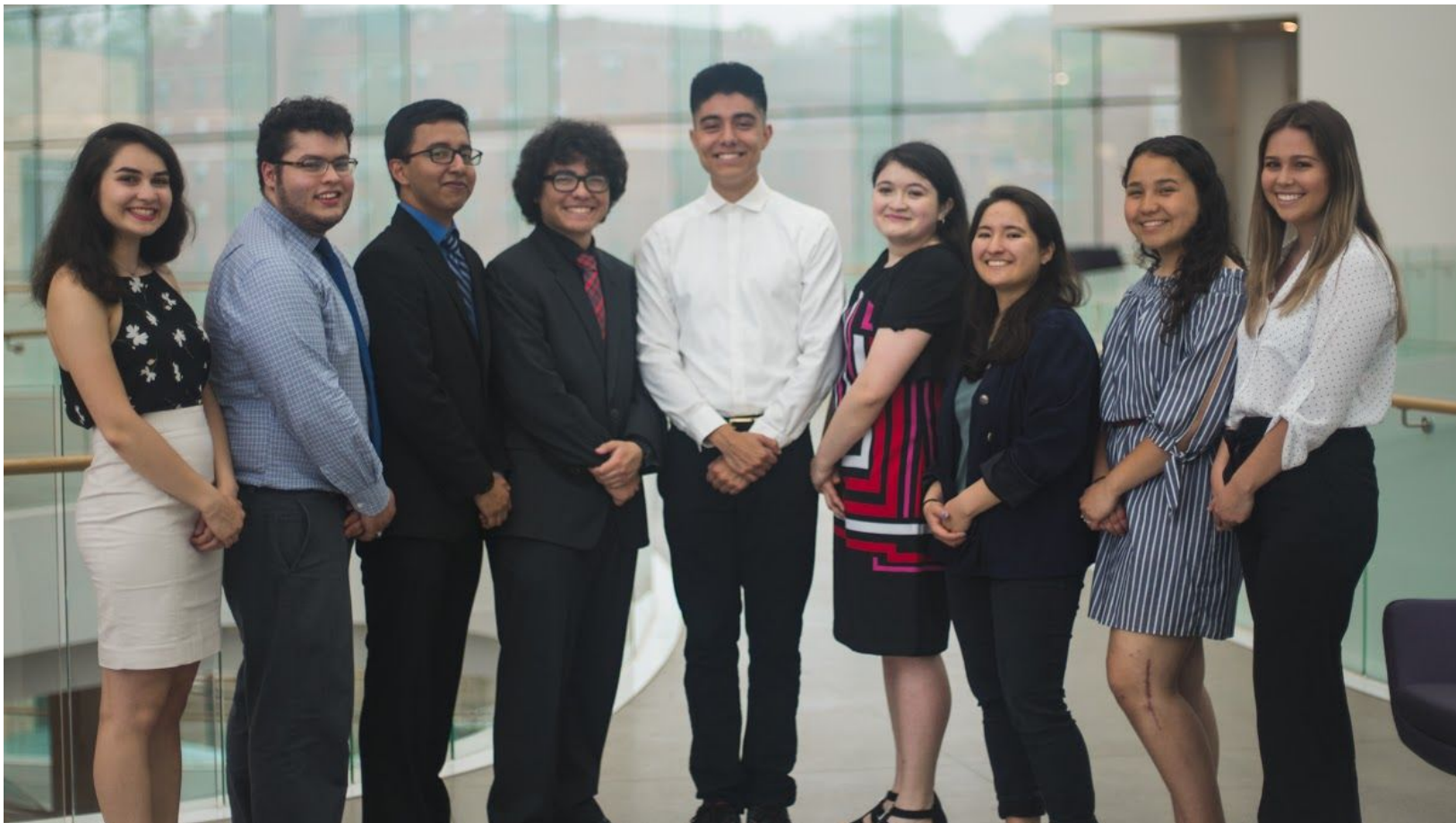
2019 - 2020 Executive Board